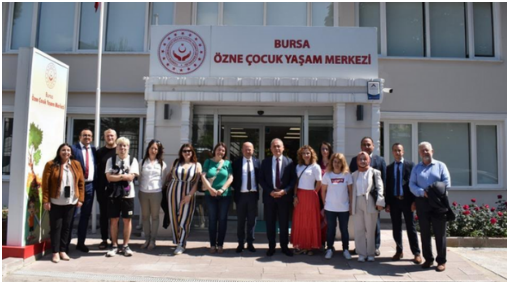
SoJust partners visited the Ozne Çocuk Yasam Merkezi, one of the institutions that implemented the pilot test.